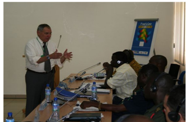
IOTB special operations Senior Fellow discusses collaborative security issues with strategic regional partners during Special Operations Command Europe's West Africa Regional Internal Security Symposium. The symposium was a joint SOCEUR & Kofi Anan International Peacekeeping Training Center event, held in Accra, Ghana, Sept '07